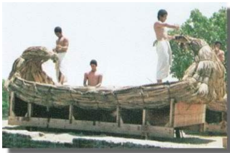
Boat Building by Traditional Methods

The Pharaonic Village is not a collection of static and unchanging exhibits. Rather, it is a living, breathing entity that changes day by day with numerous activities from ancient Egypt. The ancient Egyptians were not so different from us, actually. They worked hard at their daily jobs and greatly enjoyed recreation time. The "inhabitants" of the Pharaonic Village have worked to recapture these daily activities and bring them to life for you. From work to play, industries and festivals, there is always something new going on in the Pharaonic Village.