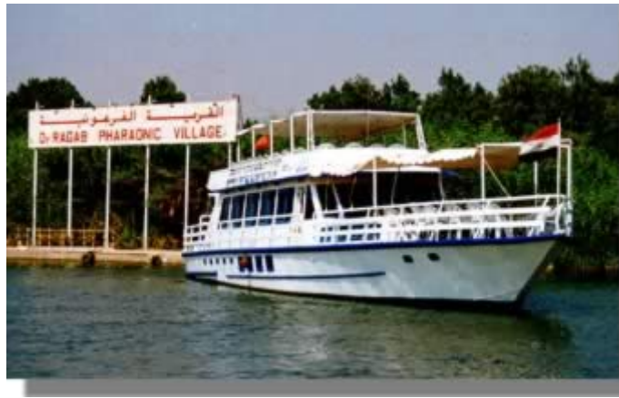
The Yacht Nefertari Embarks on Another Spellbinding Tour

The Pharaonic Village is an experience like no other. The instant you begin sailing down the canals that circuit through the island you are immersed totally in the Egypt of history and legend. Everywhere you look, you will find more and more of the sights and sounds of ancient Egypt, until finally you could believe that you have truly traveled through time to a distant and glorious past. And some of the sights you will see are veritable masterpieces, faithful to their ancient originals in every detail.