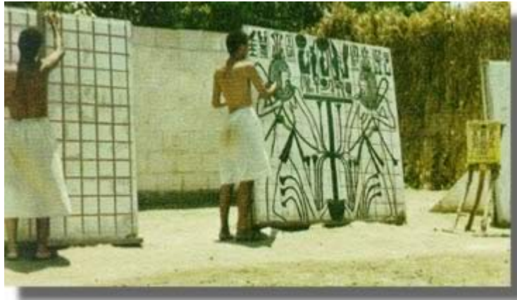
Some Local Artisans Work on Temple Paintings

The ancient Egyptians loved art and their modern counterparts are no different. All over the Pharaonic Village, artisans work to create elaborate masterpieces using ancient styles and techniques, carefully researched to ensure a high level of realism. Painters, sculptors, scribes and even potters are all present in the Pharaonic Village, each one working on a very special project for the village. Many of the artifacts created will go on to enrich the authenticity of the village and the enjoyment of your tour, and in fact, all of the paintings, sculptures, and statues you see on your tour were created within the boundaries of the village by these artisans.