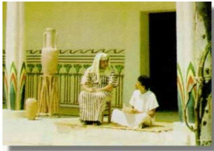
A Nobleman Relaxes at His Home

The ancient Egyptians loved art and their modern counterparts are no different. All over the Pharaonic Village, artisans work to create elaborate masterpieces using ancient styles and techniques, carefully researched to ensure a high level of realism. Painters, sculptors, scribes and even potters are all present in the Pharaonic Village, each one working on a very special project for the village. Many of the artifacts created will go on to enrich the authenticity of the village and the enjoyment of your tour, and in fact, all of the paintings, sculptures, and statues you see on your tour were created within the boundaries of the village by these artisans.