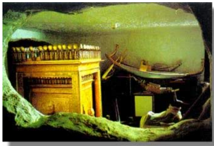
The Replica of the Tomb of Tutankhamen