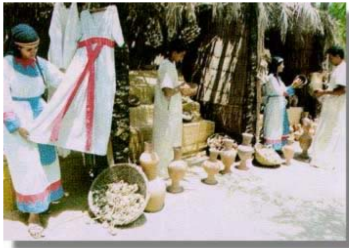
The Market is Only One of the Many Sights to See