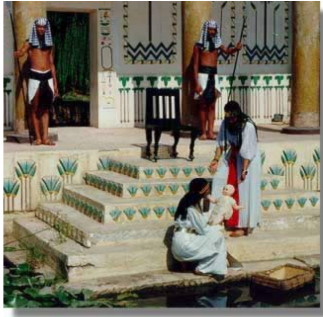
A Familiar Tale Comes to Life Before Your Eyes